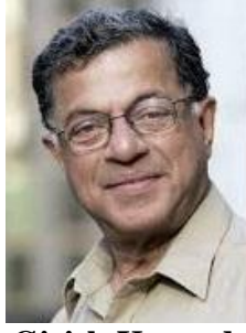
Girish Karnad (1938-2019)

A renowned Kannada playwright, author, actor and film director, Girish Karnad was born on 19 May 1938 at Matheran, Bombay Presidency (now Maharashtra). After graduating from Karnataka University in 1958, Girish Karnad studied philosophy, politics, and economics as a Rhodes Scholar at the University of Oxford (1960–63).